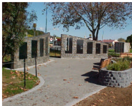
Hauraki Plains Memorial Wall

Cemeteries are provided at Paeroa and Waihi and include provisions for lawn burials, ashes, and RSA burials. A Memorial Wall is provided at Ngatea. Due to unsuitable ground conditions on the Hauraki Plains, Council has been unable to provide a central cemetery for the Plains community. For burial of residents from Plains area, Council has an agreement with Thames-Coromandel District Council where the out of district component of the burial costs is met by the Plains Ward.