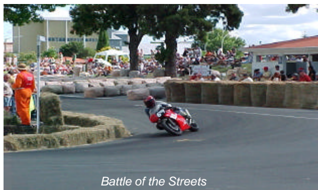
Battle of the Streets