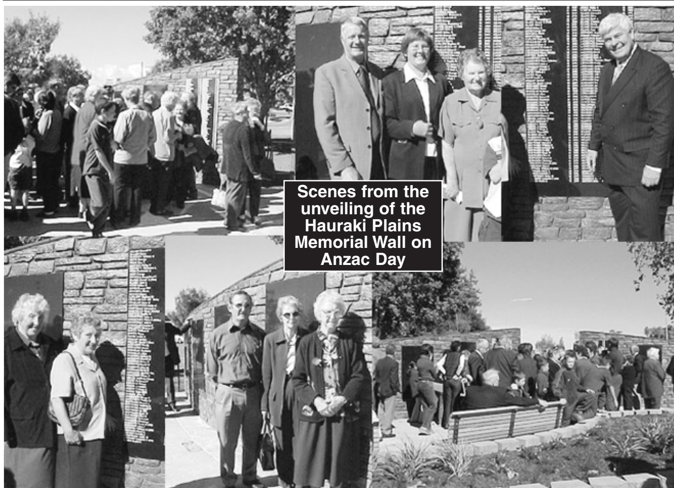
Scenes from the unveiling of the Hauraki Plains Memorial Wall on Anzac Day