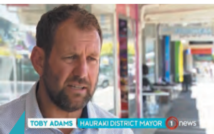
TOBY ADAMS HAURAKI DISTRICT MAYOR

Ordinarily, we have enough treated water stored in our reservoir to supply the town for about three days. However, due to the dry conditions and low river levels restricting our water intake, we had less treated water stored in the reservoir and less time up our sleeve before it ran dry.