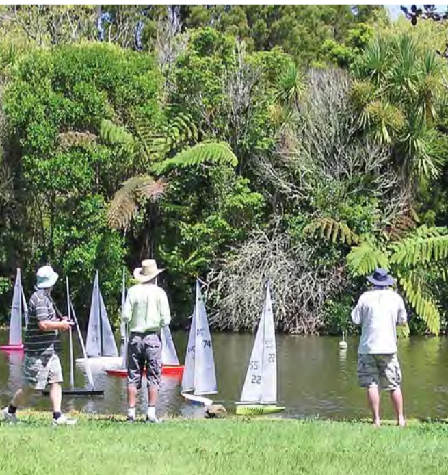
Above: Waihi's Gilmour Lake will host next month's International One Metre class Bay of Plenty champs.

Spectators are very welcome to come and enjoy the action, too, just as they do most Sundays at local sailing events on the lake. "We race from 1.00pm to 4.00pm, but the skippers usually arrive in the morning for a bit of practice, and keen onlookers often have the controls thrust into the hands," says Dave.