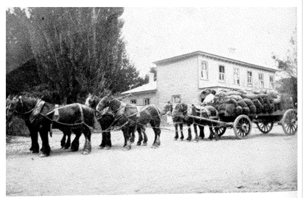
MACKAYTOWN HOTEL AND 8-HORSE TEAM (1902, W. Turner)