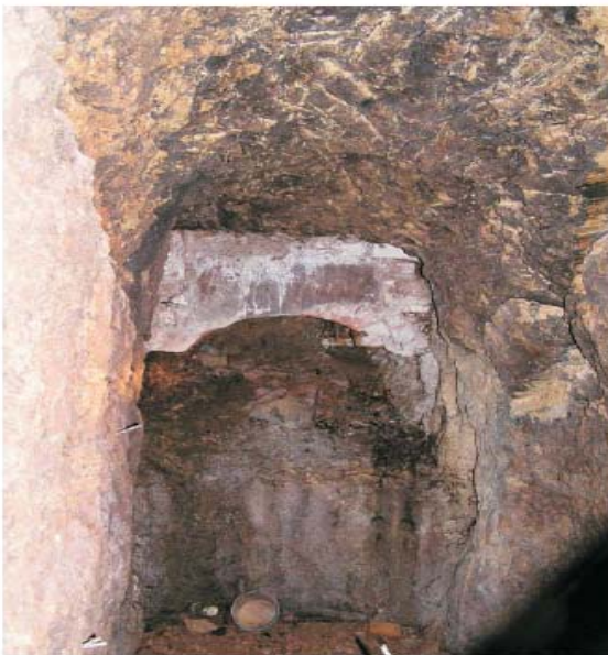
CHUTE OF ONE OF THE WAITEKAURI ORE ROASTING KILNS