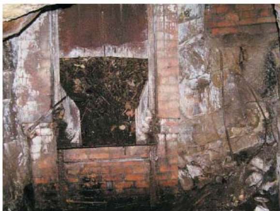
TWO OF THE UNION HILL ROASTING KILN ORE CHUTES