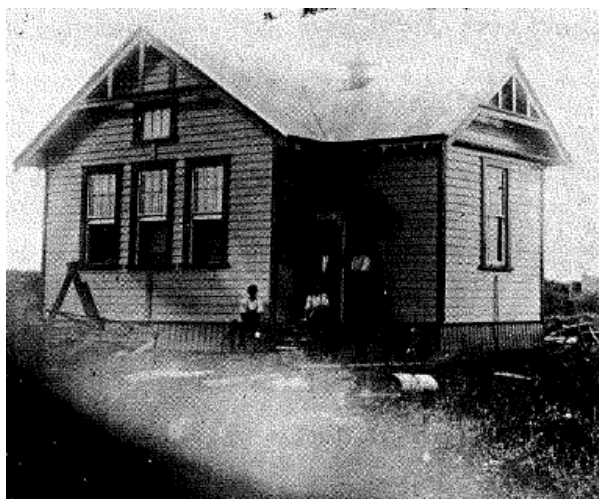
Waitakaruru School, 1918