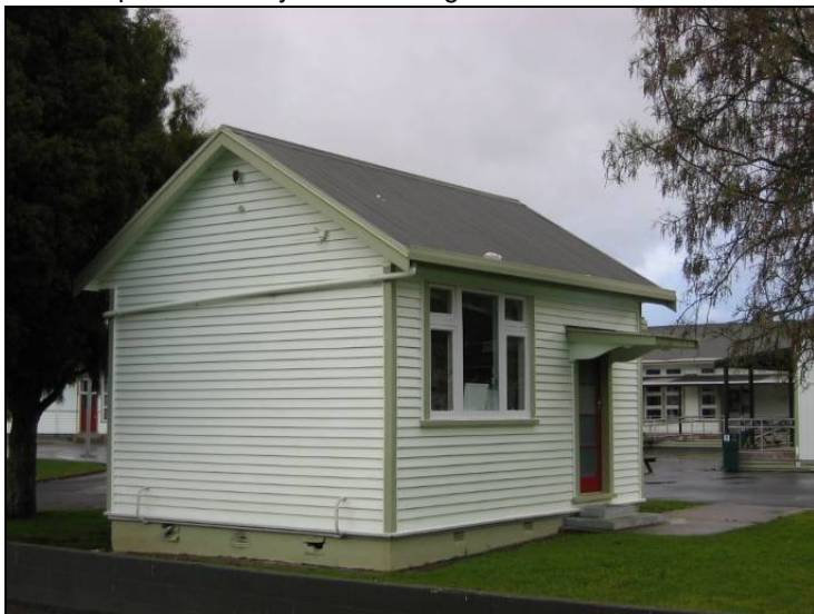
Dental Clinic at Kerepehi School

Transplanted and much modified Kaihere school house with lean to attached to side and part of heavily modified original 1902 school attached at left.