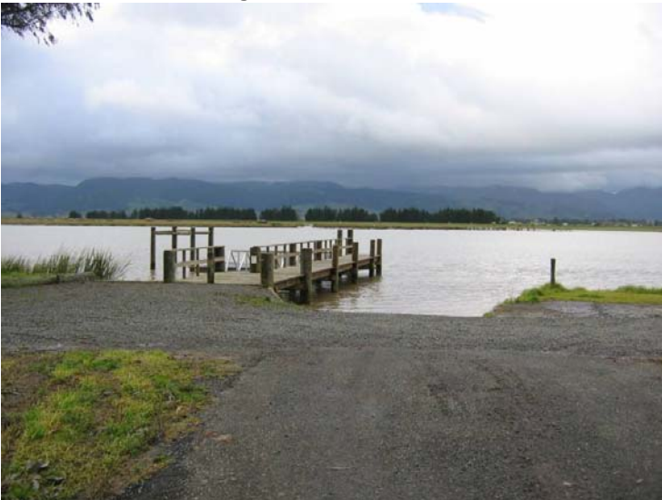
Above: Wharf built 2000