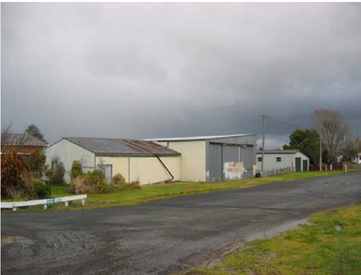
"Store Corner" looking West from the town wharf.