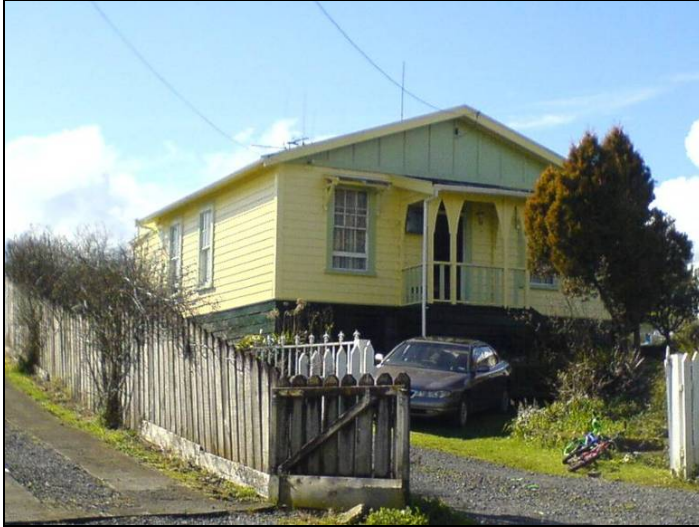
42 Aorangi Rd