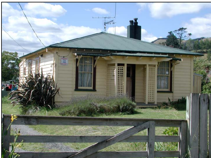
52 Aorangi Rd