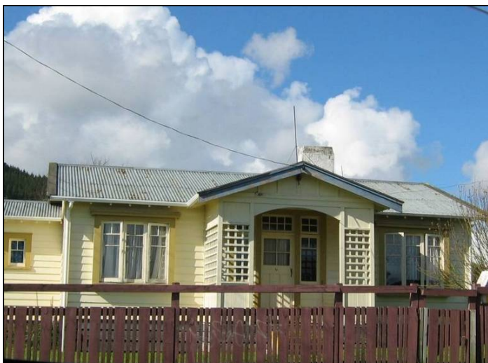
7 Ainsley Rd.