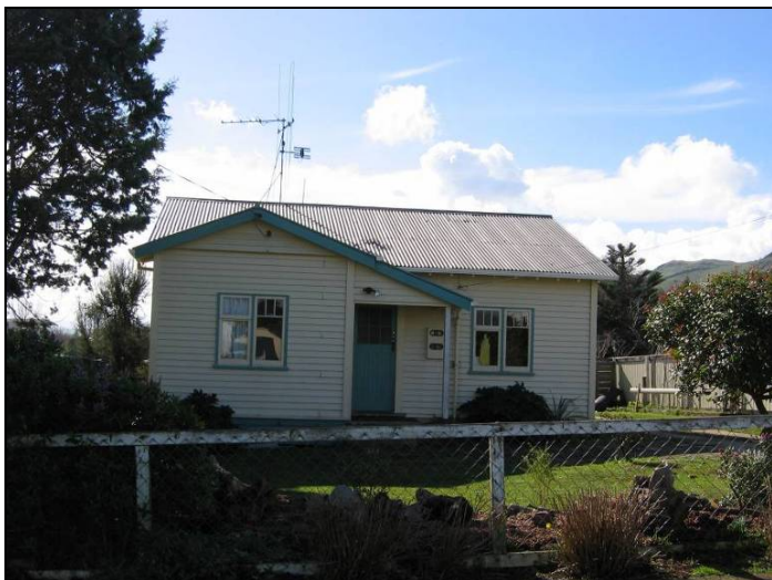
6 Porritt St.