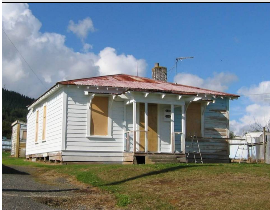
Station Master's House, 5 Ainsley Rd.

Location: Seventeen houses in Aorangi Road, Ainslie Road and Porritt St, Paeroa