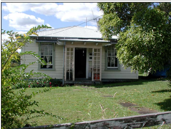
44 Aorangi Rd