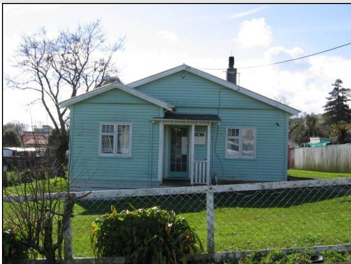
4 Porritt St.