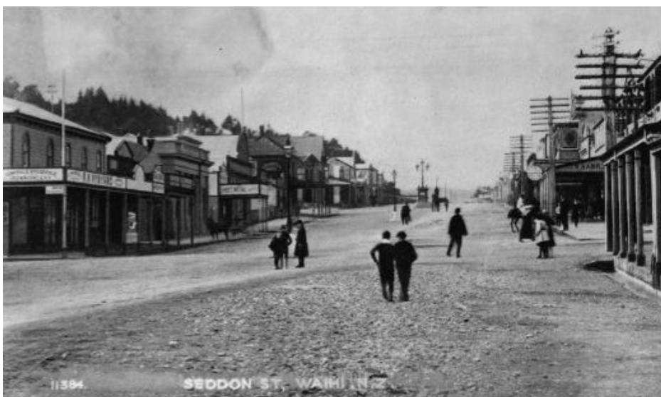
Seddon Street, Rider on horse on right, tethered horse on left side of street, 1910 1/2-057519 Alexander Turnbull Library http://find.natlib.govt.nz/primo_library/libweb/action/display.do?ct=display&doc=nlz_tapuhi561386&indx=7&v!(freeText0)=Seddon