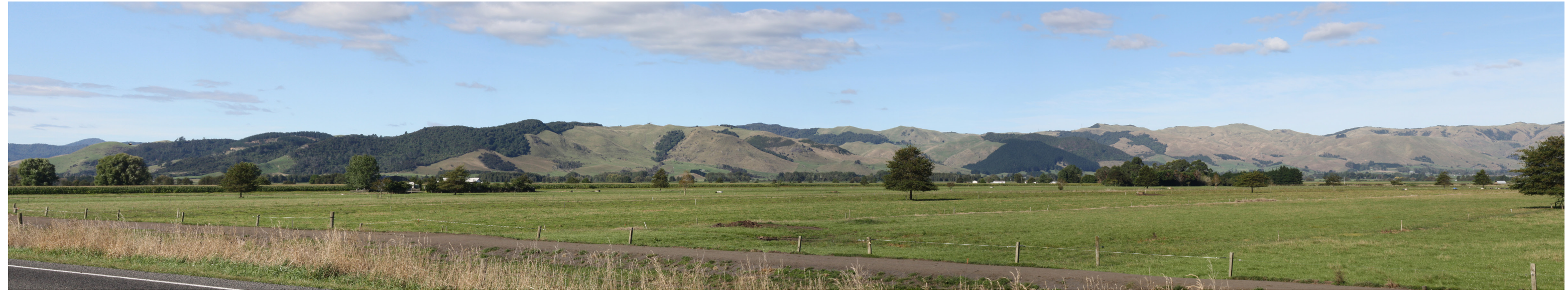
Figure A10 : View toward the site from Paeroa Tahuna Road approximately 1.7km south-west of its intersection with Endowment Road.