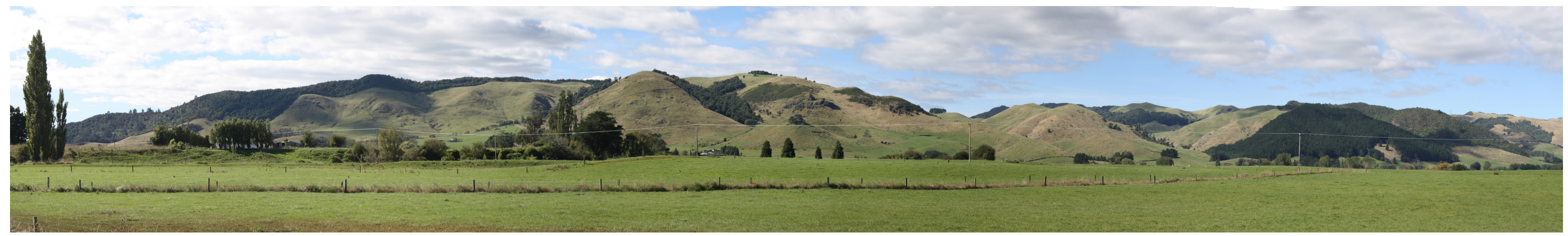
Figure A9 : View toward the site from State Highway 26 approximately 1.5km south of Rawhiti Road (North end)