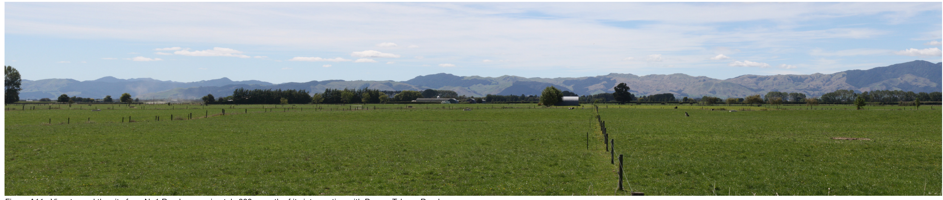
Figure A11 : View toward the site from No1 Road, approximately 800m south of its intersection with Paeroa Tahuna Road.