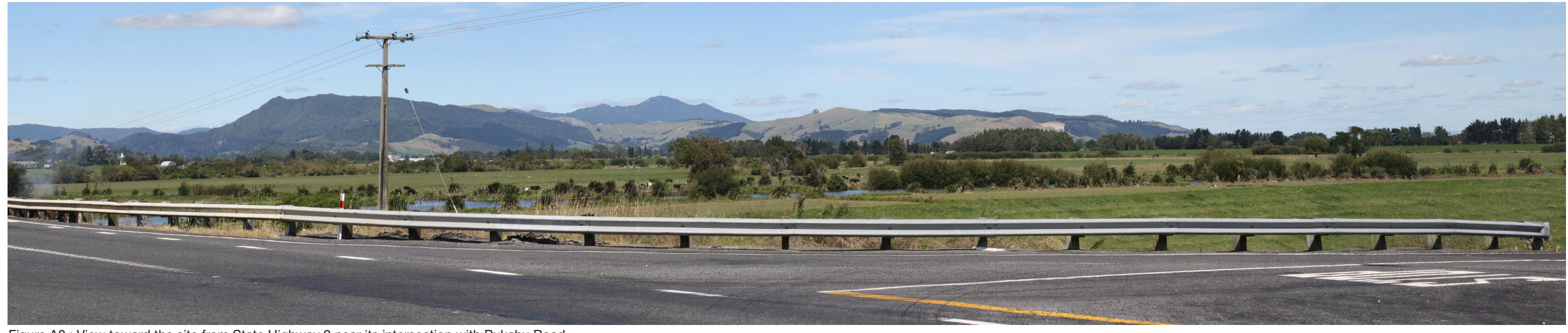
Figure A8 : View toward the site from State Highway 2 near its intersection with Pukahu Road