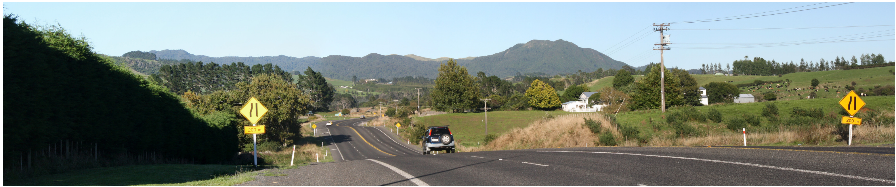
Figure A13 : View toward the site from State Highway 2 near its intersection with Campbell Road, approx. 2km west of Waihi.