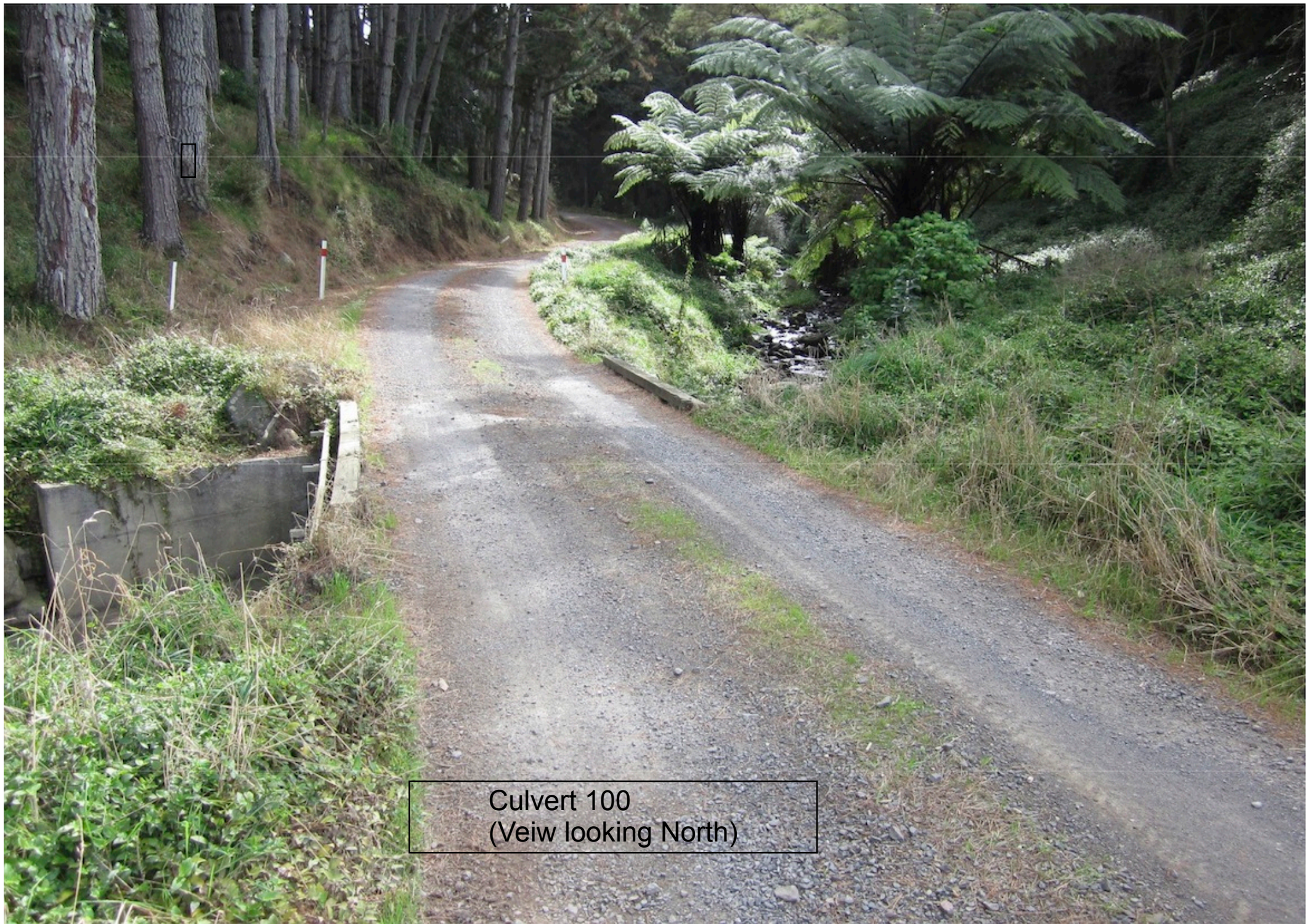
Culvert 100 (Veiw looking North)