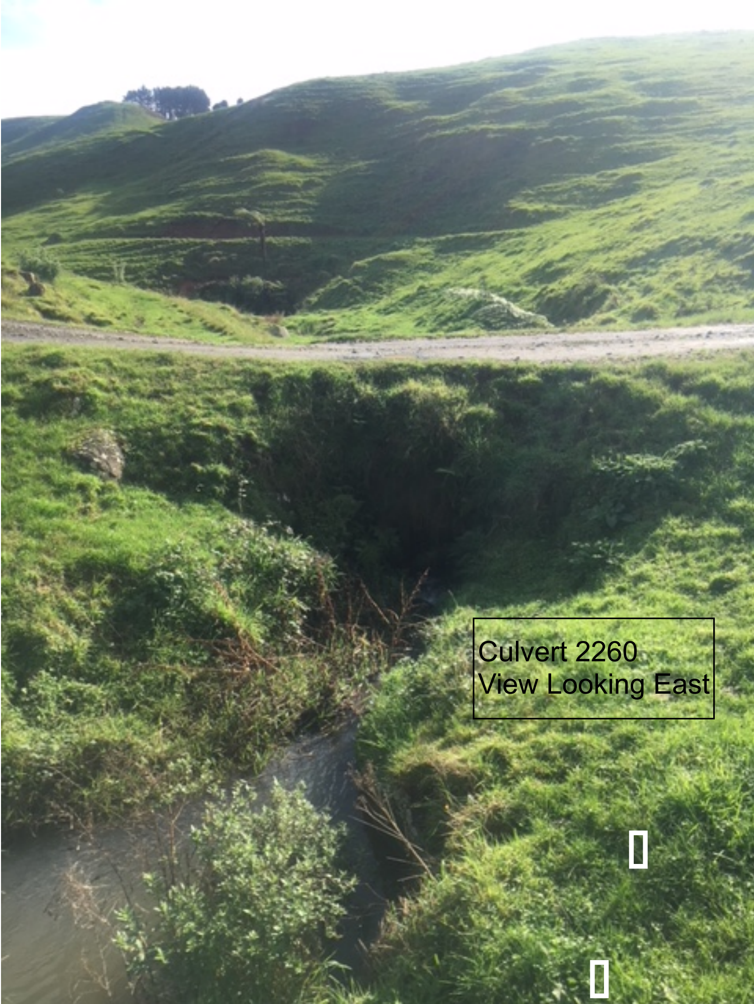
Culvert 2260 View Looking East