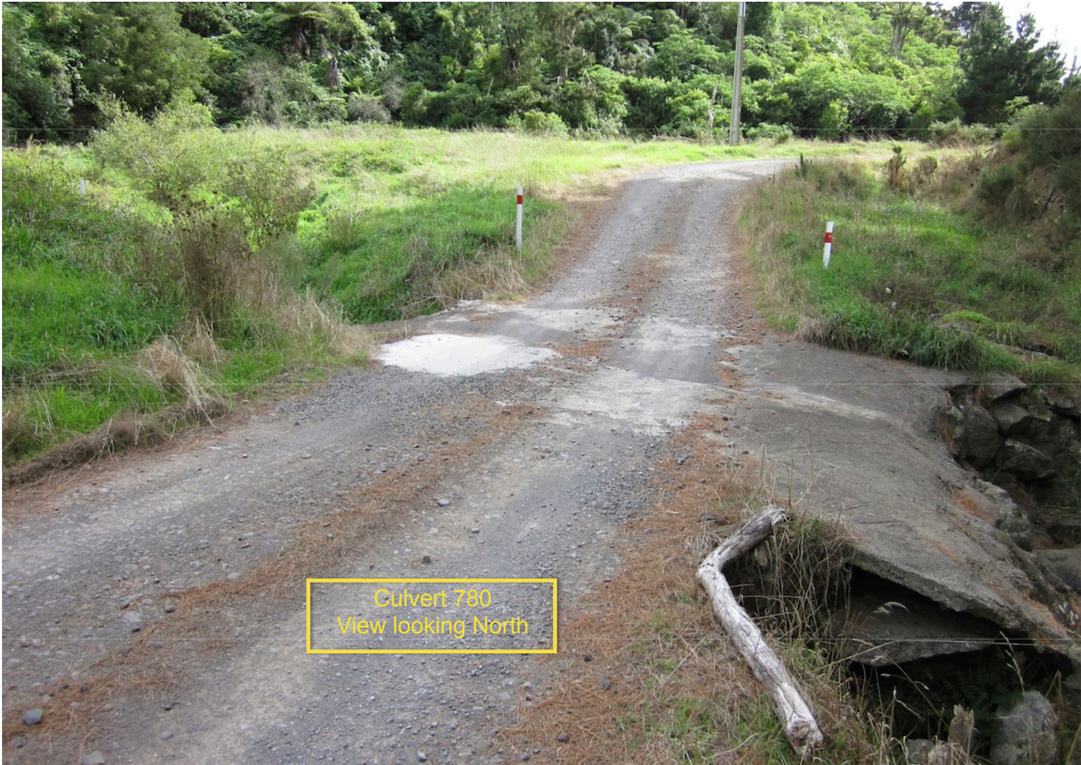
Culvert 780 View looking North