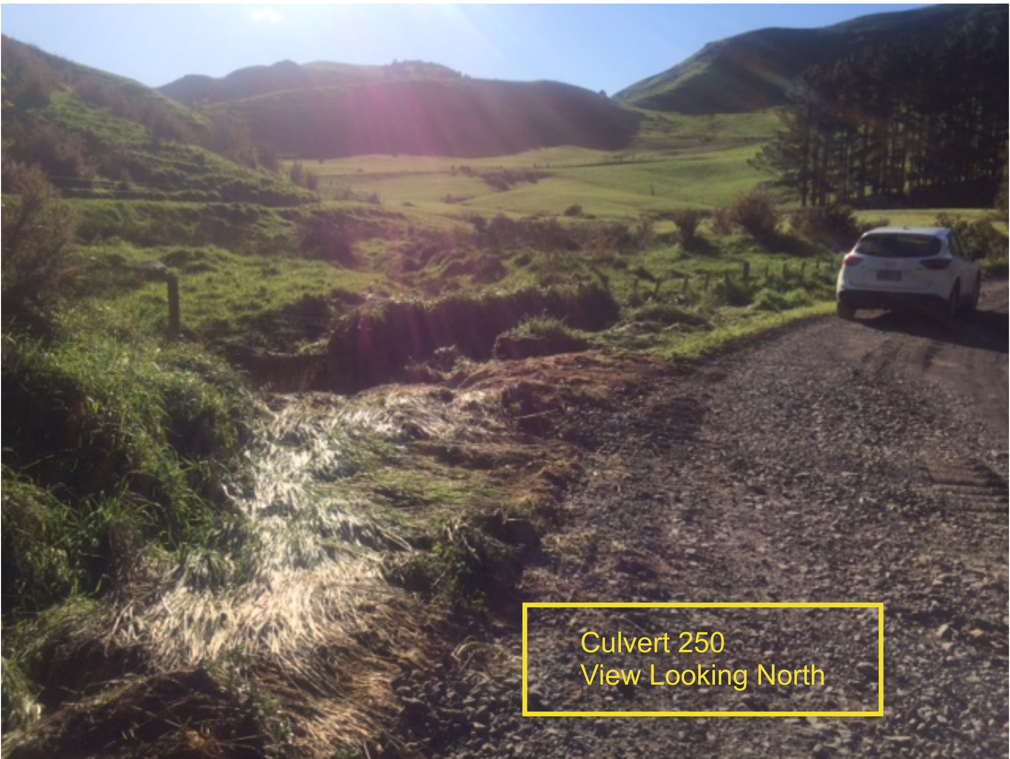
Culvert 250 View Looking North