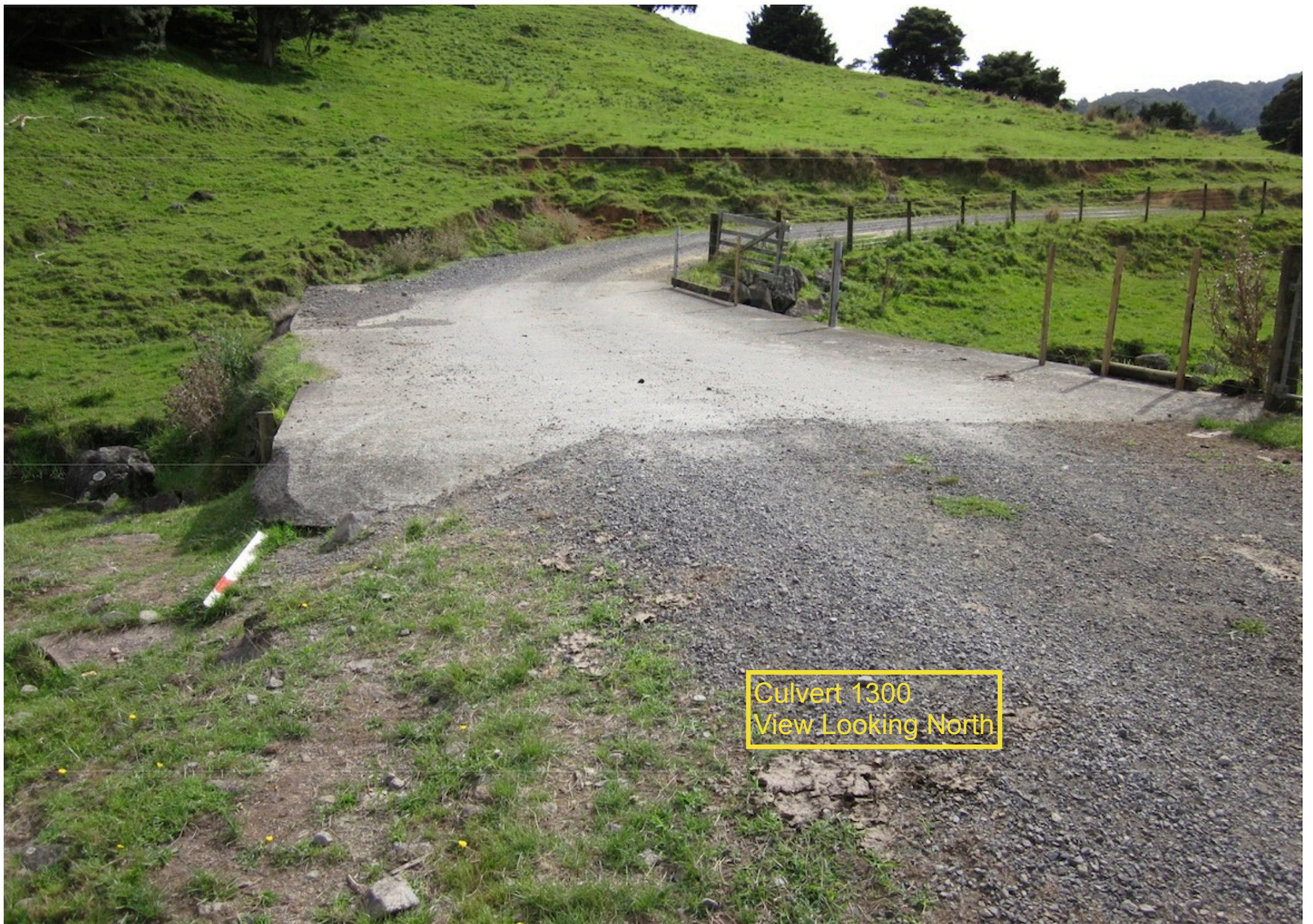
Culvert 1300 View Looking North